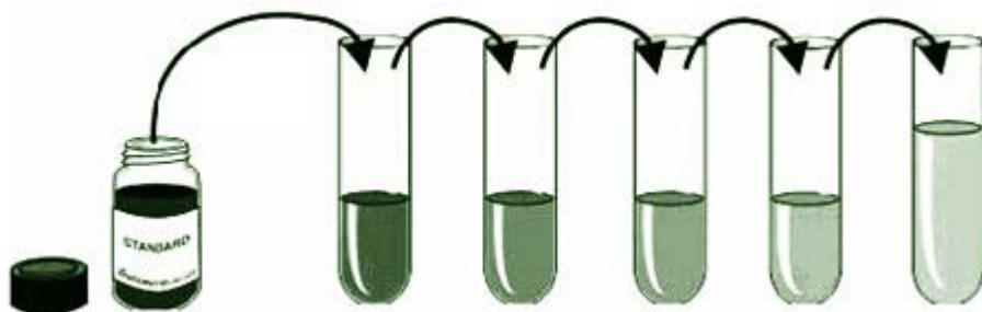
80ng/ml 40ng/ml 20ng/ml 10ng/ml 5ng/ml 2.5ng/ml

2. The number of stripes needed is determined by that of samples to be tested added by that of standards. It is suggested that each standard solution and each blank well should be arranged with three or more wells as much as possible.